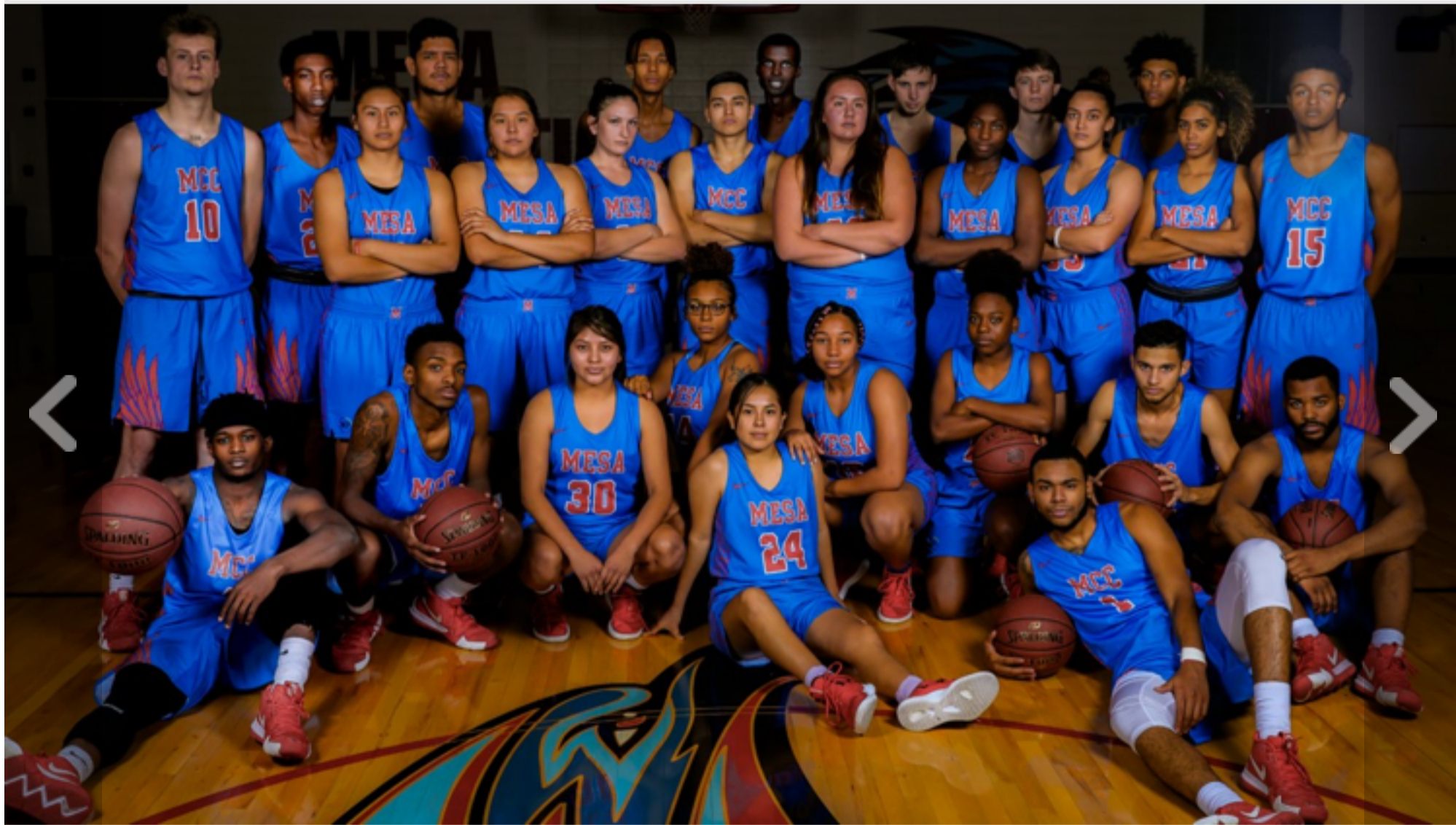
01 / 05 The men's and women's basketball team at Mesa Community College will wear special Nike uniforms in celebration of Native American Heritage Month.